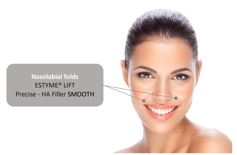
Injection area of ESTYME® LIFT and Precise - HA Filler SMOOTH

ESTYME® LIFT and Precise - HA Filler SMOOTH are used in adult subjects, excluding pregnant and breastfeeding women.