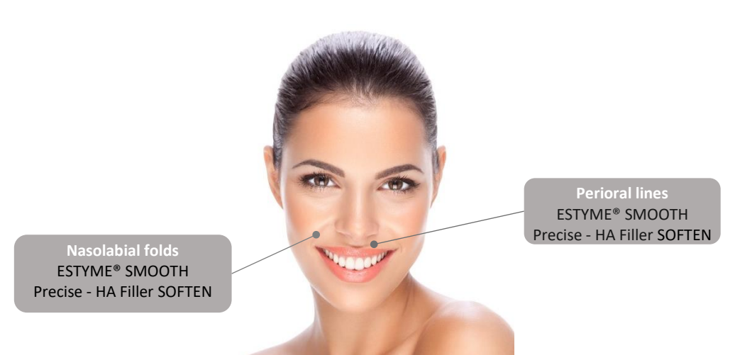
Injection areas of ESTYME® SMOOTH and Precise - HA Filler SOFTEN

ESTYME® LIFT and Precise - HA Filler SMOOTH are used in adult subjects, excluding pregnant and breastfeeding women.